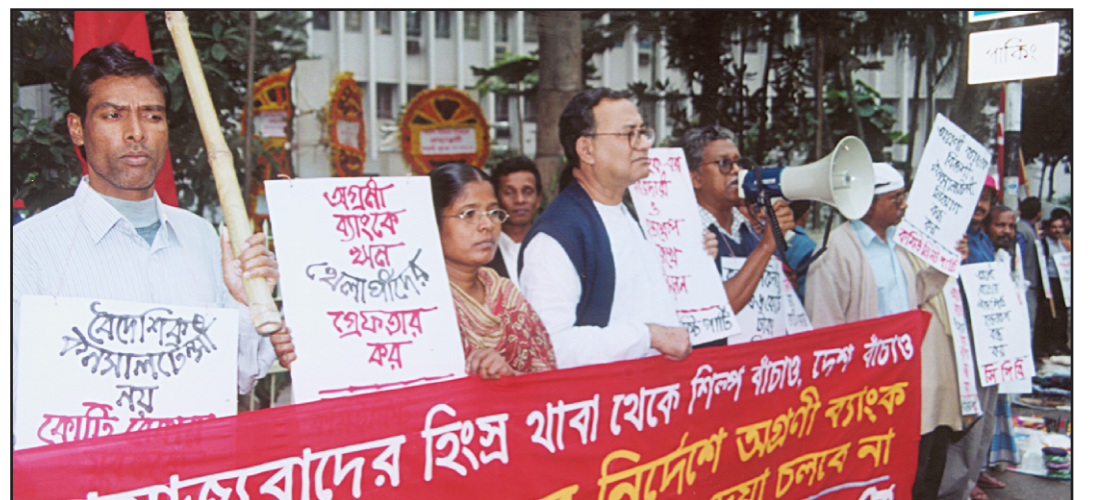
The Communist Party of Bangladesh stages a demonstration in front of the Agarani Bank headquarters in Dhaka yesterday protesting appointment of a foreign consultancy firm to run the Agrani Bank management.