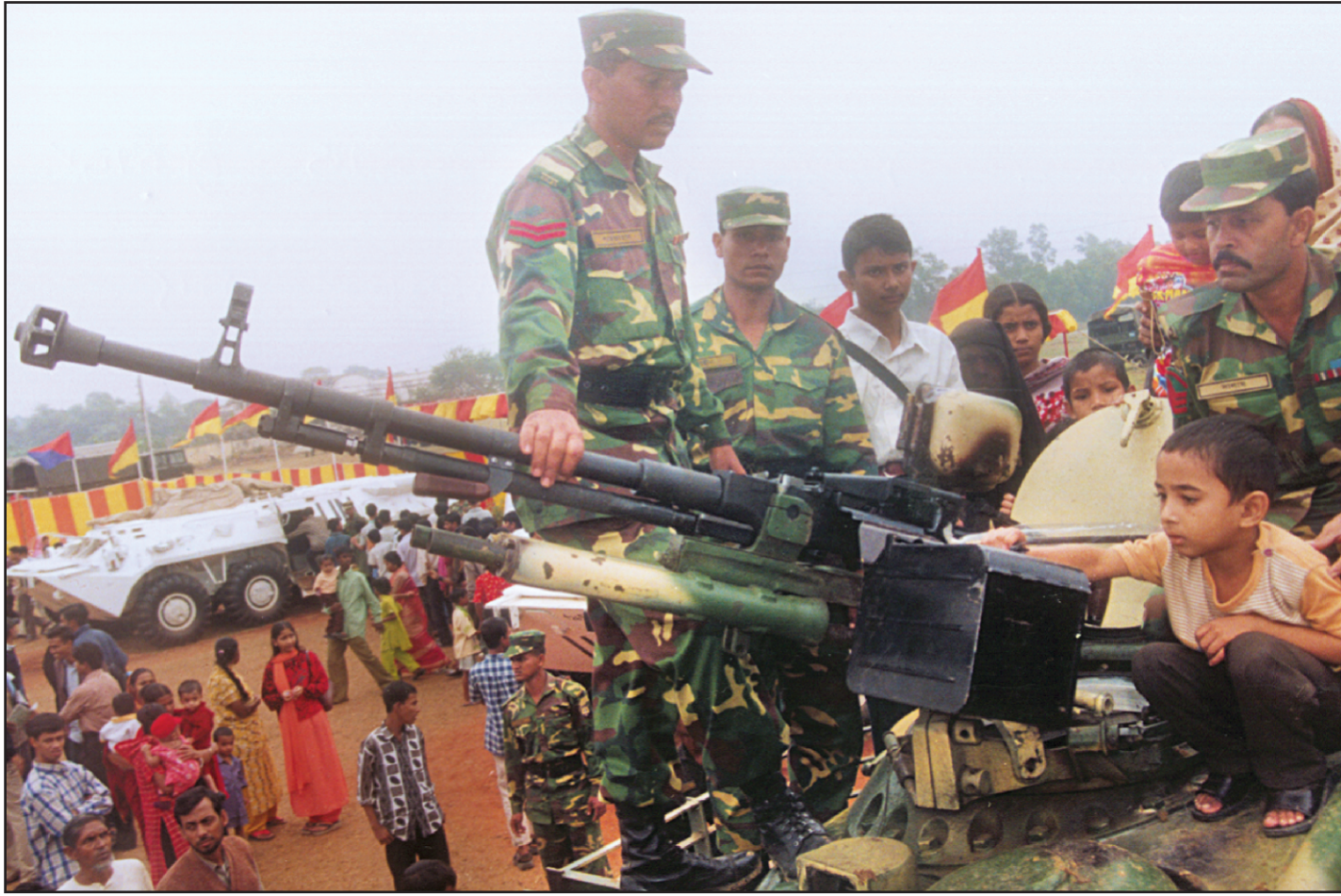
A child sits on a tank at the Military Hardware Display in Old Airport area in Dhaka on Tuesday. The exhibition was jointly organised by the army, navy and air force on the occasion of Victory Day.

They will also participate in three workshops in Dhaka, Khulna and Chittagong.