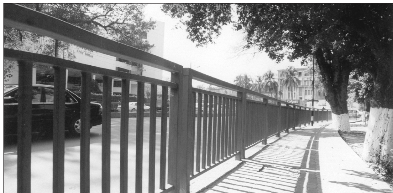
SYED ZAKIR HOSSAIN

The BIWTA evicted a total of 576 illegal structures on the banks of Buriganga during a weeklong drive from October 19 to 25.