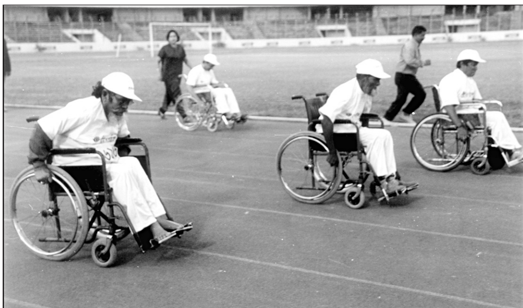
STILL GOING STRONG: Liberation War veterans participate in a wheel-chair race, which was the first ever sports competition for the disabled freedom fighters. It was arranged by the Bangladesh Olympic Association at the Sher-e-Bangla National Stadium in Mirpur yesterday.