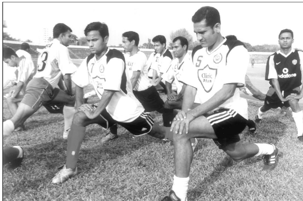
Mohammedan booters stretching during their practice session at the Army Stadium on Thursday.