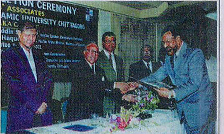
(Hon'ble Speaker of the Parliament was present as Chief Guest on the occasion of MBA 8th Batch Course Completion Ceremony at Dhaka Sheraton Hotel)

IIUC Dhaka Campus offers MBA Program for Executives (Evening shift) for the coming semester.