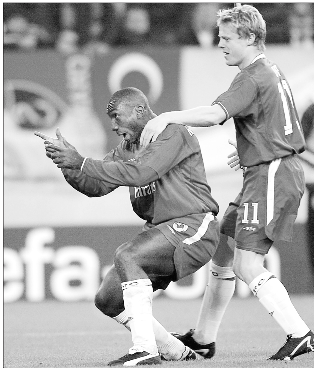
SHOOTING 'EM DOWN! Chelsea's Dutch striker Jimmy Floyd Hasselbaink (L) celebrates scoring against Besiktas at Gelsenkirchen on December 9.

Porto, not to be outdone, came close to snatching a win in the final five minutes, Jose Bosingwa forcing a great tip-over from Real's second-string keeper Cesar with a 30-metre blast.