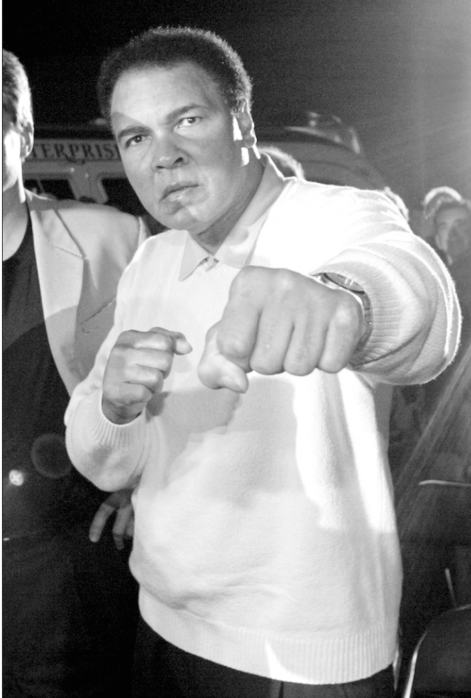
ONCE A CHAMP ALWAYS A CHAMP: Boxing legend Muhammad Ali takes up his boxing stance at the US premiere of his tribute book "Greatest Of All Time" at the Miami Beach Convention Centre in Miami Beach on December 6.