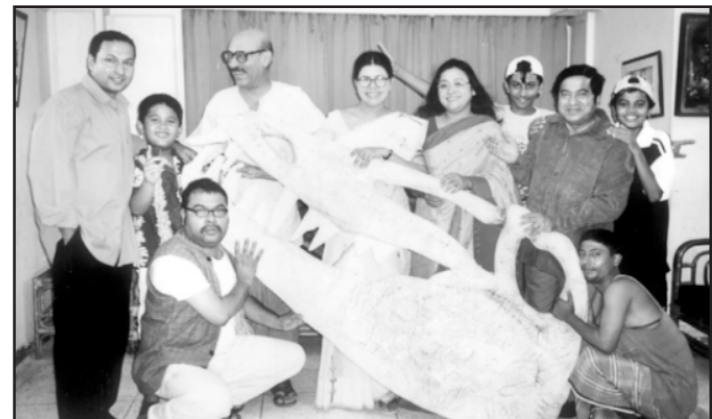
The characters in the drama serial T-Rexer Shandhaney finally discovers the prehistoric animal.

The story involves three teen-aged boys--Topon, Raju and Khaled, who are cousins. Among them Khaled has just come to Bangladesh from the US to learn about the culture and history of his grandfather's country. The boys are always kept under strict control by the elders of the house. The list includes Topon's uncle who is extremely miser and considers children mischievous. There are also Raju's mother--a very hot tempered woman, and his uncle who is idle and very nasty. The family has another member--Chandu Chacha who thinks himself very important. Only the youngest uncle of these three youth