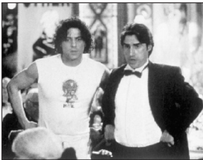
The Wog Boy

"Australia is more commonly known in Bangladesh as a sporting