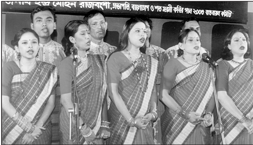
Artists rendering folk songs at the on-going festival of hundreds of folk poets.