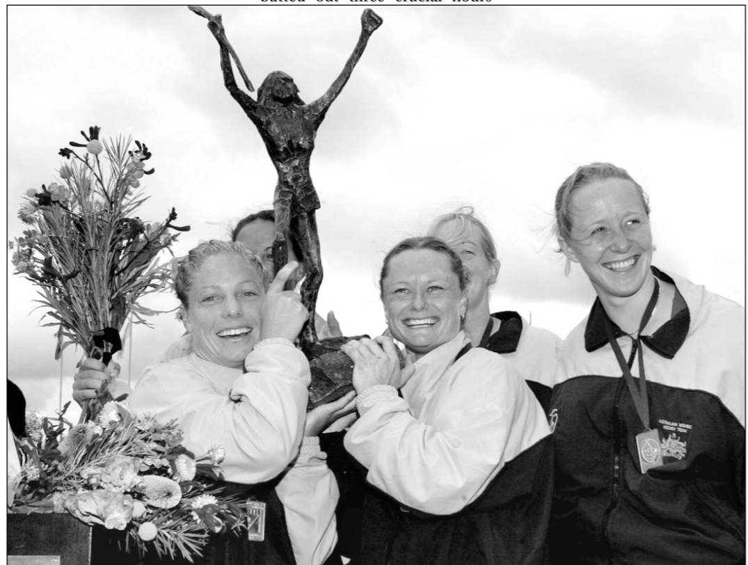
Australian players hold aloft the trophy after defeating China in the Women's Champions Trophy hockey final in Sydney yesterday.

"It was a thrilling match and wonderful for the crowds to watch and they will surely come back to watch more Tests," he added.