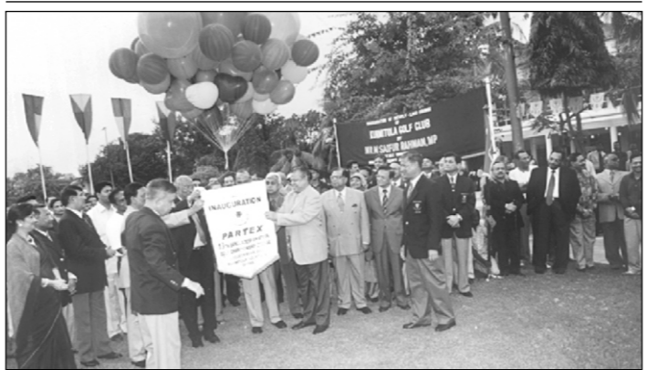
Finance and Planning Minister M Saifur Rahman inaugurates the Partex 19th Bangladesh Amateur Golf Championship and the newly-laid course of Kurmitola Golf Club at the club premises on Friday. The tournament proper starts tomorrow with players from Bhutan, India, Nepal, Pakistan, Sri Lanka and hosts Bangladesh taking part.

Today's Cryptiquip Clue: S equals L. The Cryptiquip is a substitution cipher in which one letter stands for another. If you think that X equals O, it will equal O throughout the puzzle. Single letters, short words and words using an apostrophe give you clues to locating vowels. Solution is by trial and error.