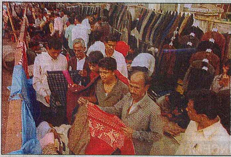
CHECK THE CHILL: Sale of warm clothes peaks in footpath shops in front of the General Post Office at Gullistan yesterday. Light early morning fog in Dhaka has hinted at the arrival of a cold spell, prompting the poor to mount their guard.

The detention order was challenged before the HC, which on November 15, 2003 directed the district magistrate to appear before the court along with supportive papers.