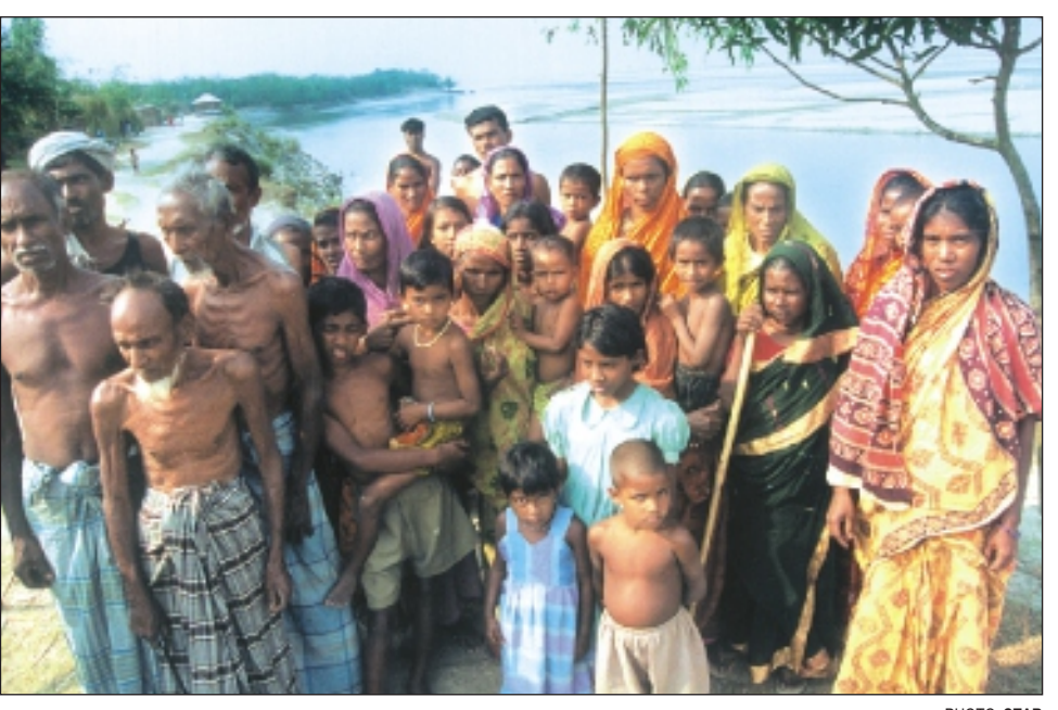
People sheltering on the Bijoy embankment in Gangachhara, Rangpur face an uncertain future after the Teesta River devoured their homesteads.

"It also suggested formation of a special court or tribunal for trying SEE PAGE 11 COL 5