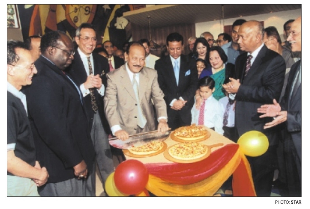
Local Government, Rural Development and Co-operatives Minister Abdul Mannan Bhuiyan, centre, and Commerce and Industries Minister Amir Khasru Mahmud Chowdhury attend the opening of a Pizza Hut branch yesterday in Gulshan.

Distinguished personalities including diplomats were, among others, present at the function where they relished signature pizza