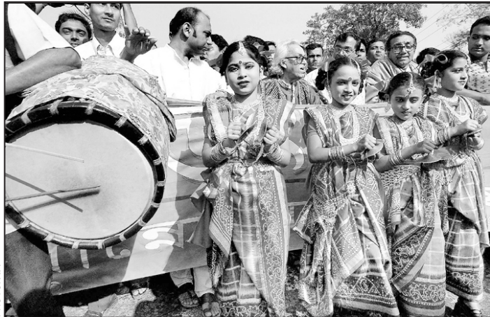
Girls performing dance during the celebration of Nabanna, the festival of the new harvest, in the city.

People in Bangladesh, have been celebrating Nabanna for centuries mainly in the rural areas. Celebration begins soon after harvesting of the crops. Farmers return home with loads of golden