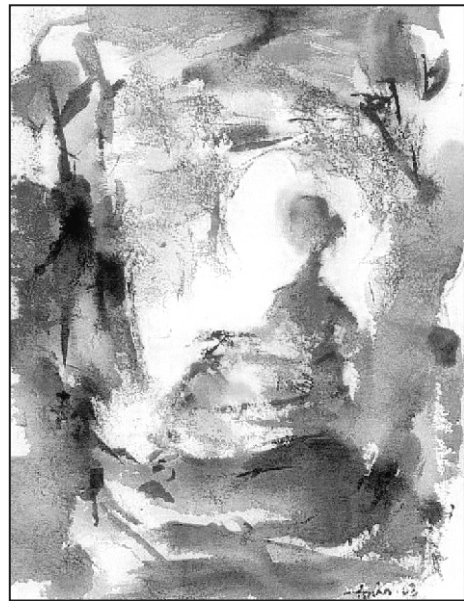
Two paintings from the exhibition Bengali Spring.

One of Anis's paintings has a young woman in pink. She is seated against the tree trunk, with the blue and green of the sky cascading at the back, with the russets and greens of the surrounding nature, further couching her figure. Tiny white sails of boats and suggestions of pristine white birds have been included in the backdrop. The painting is as fresh and energizing as a whiff of wonderful French perfume. More semi-abstract in style is the seated lady in