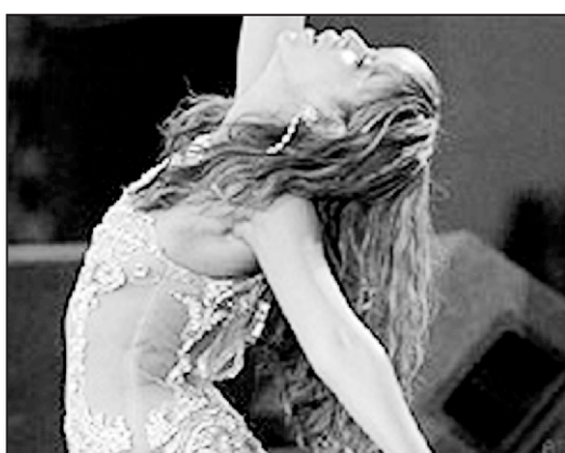
Beyonce Knowles leads the field with six nominations.

The late Beatle George Harrison is nominated in the best male pop vocal performance, best pop vocal