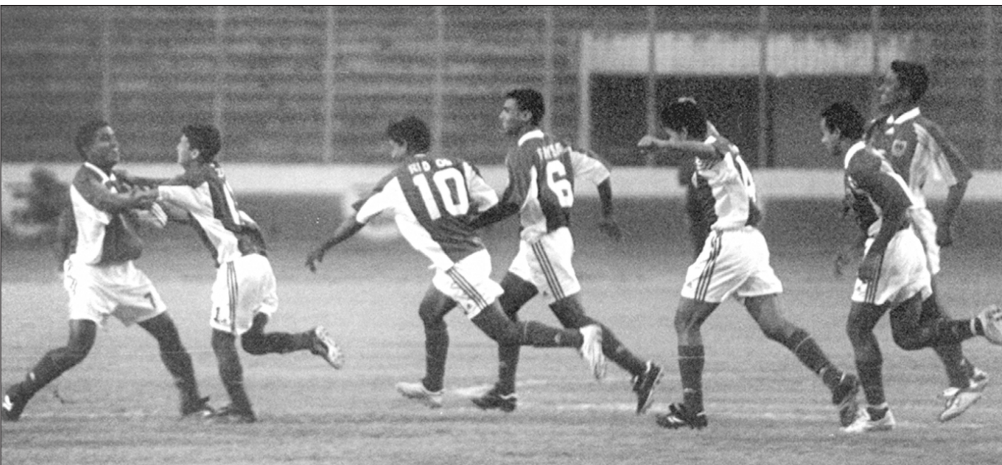
DELIGHT BEFORE DESPAIR: Bangladesh team members celebrate after scoring a goal against Nepal during the AFC Under-20 Championship at the Sher-e-Bangla National Stadium in Mirpur yesterday.