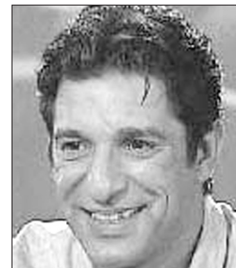
WASIM AKRAM the local bowlers for two weeks. "We had an intention to bring him before the Zimbabwe tour but it was not possible as he had his commitments as a commentator for ESP-Star. He will work with the boys for two weeks after Bangladesh team

Cricket SPORTS REPORTER Legendary Pakistani fast bowler Wasim Akram is likely to impart his vast knowledge on Bangladeshi quicks in March 2004. The Bangladesh Cricket Board (BCB) is planning to bring the world's greatest ever left-arm paceman before Bangladesh's home series against India in April. "We have already talked to him and he has primarily accepted our proposal to help the Bangladesh bowlers. But the financial matters are yet to be finalised. One of our officials is keeping constant contact with him," informed a highly placed BCB official on condition of anonymity. The former Pakistani captain, who recently appeared before a civil court in Lahore after a petition was filed against him for reportedly 'accepting' a coaching programme with Indian bowlers, will work with