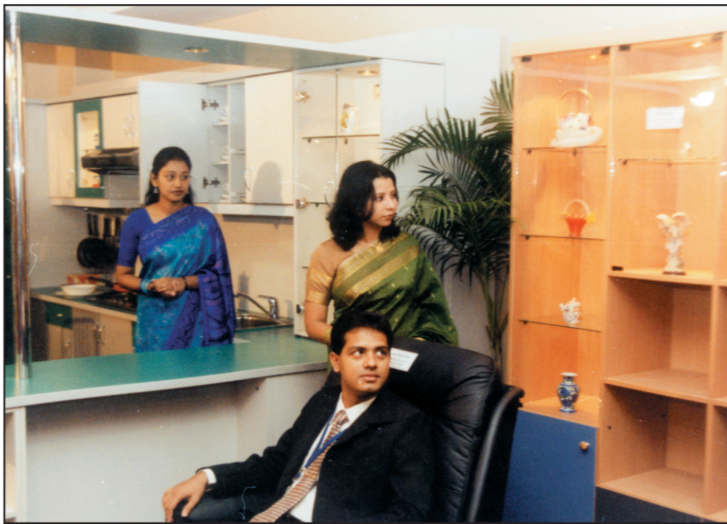
Visitors at a four-day international architectural building materials exhibition that began at Sheraton Hotel in the city yesterday.

A seminar on 'Economic growth and poverty reduction in Bangladesh', organised jointly by the government, Jica and Asian Development Bank, will be held with Finance and Planning Minister M Saifur Rahman as chief guest. Venue: Sonargaon Hotel. Time: 10.00am.