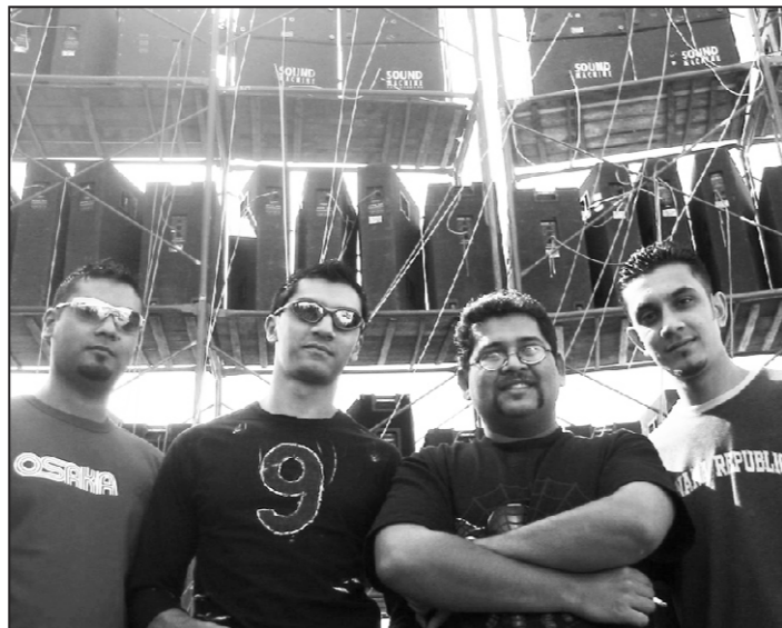
The quartet that form the band Cryptic Fate.