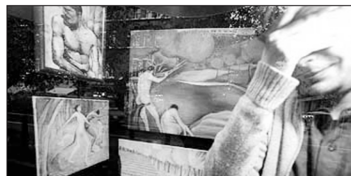
The replicas of the paintings by DH Lawrence on display at the Piccadilly branch of Waterstones bookshop in central London.

R EPLICAS of a series of paintings by the author DH Lawrence are going on public display more than 70 years after they were banned.