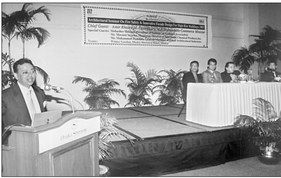
Commerce Minister Amir Khosru Mahmud Chowdhury speaks at an architectural seminar on 'Fire safety & innovative facade design for high rise buildings' at a city hotel yesterday.

For registration and other details all APE Alumni should contact the department by December 7. Telephone: 9661920-49 Ext 4980, Mobile: 019342007, 018250309, 0171405275, 018292213, 019483820.