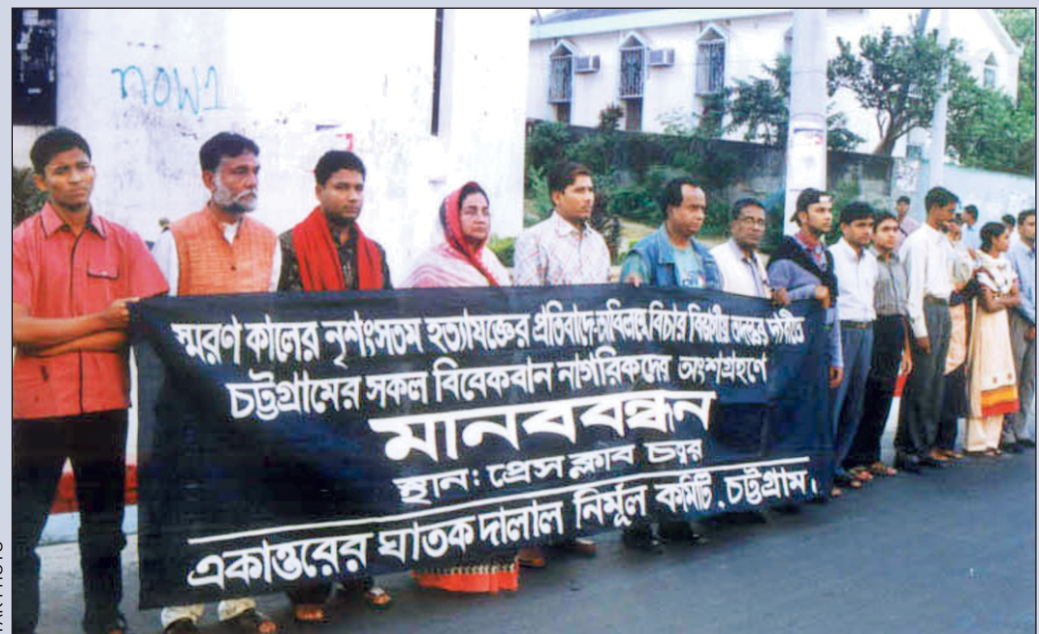
Ekkatturer Ghatok Dalal Nirmul Committee, Chittagong unit formed a human chain on November 29 in front of the Chittagong Press Club demanding judicial probe into Banskhali carnage.

The speakers stressed the need for building stronger bond of friendship, which is the essence of Eid.