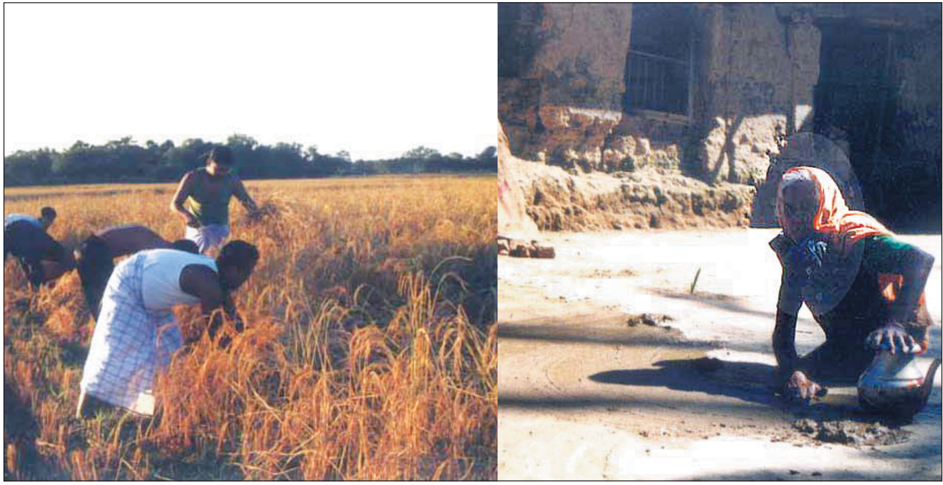
Rural people are now in a great mood as the festivity of paddy harvesting swings their mind. Farmers harvesting paddy in the field and women engaged in preparing courtyards for thrashing paddy are a common scene in the rural areas in this harvesting season of late autumn. The pictures were taken from a remote village of Chhilonia under Fatikchhari upazila.