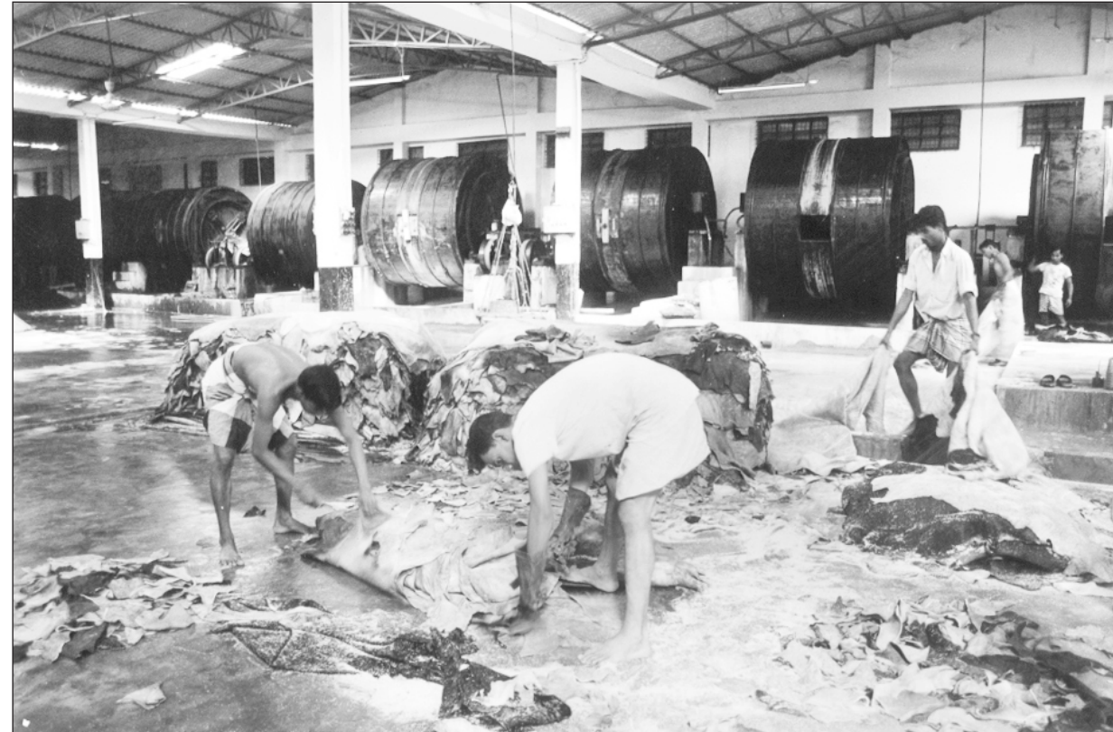
Work goes on as usual at Hazaribagh tannery, right, as tanners await government decision for relocation. Left, Toxic wastes from tanneries continue to cause health hazard.