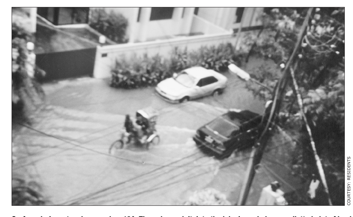
Surface drain water clogs road no 19A. The only conduit into the lake is sealed on an allotted plot of land.

On earlier promises of Rajuk, Iqbal said, "I don't know anything about tree plantation. This is