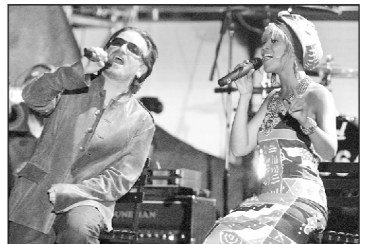
Bono and Beyonce entertained the crowd.

The overall aim for the show was to make it the most widely distributed and broadcast programme on HIV/AIDS ever, reaching a global TV, radio and online audience of about two billion. It could be viewed for