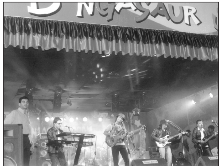
Popular band Miles in action at the Fantasy Kingdom.

The popular band Miles has already performed at the celebration. Besides fantasy dance show, mascot show, fire dance and other spectacular items are taking place as a part of the whole occasion.