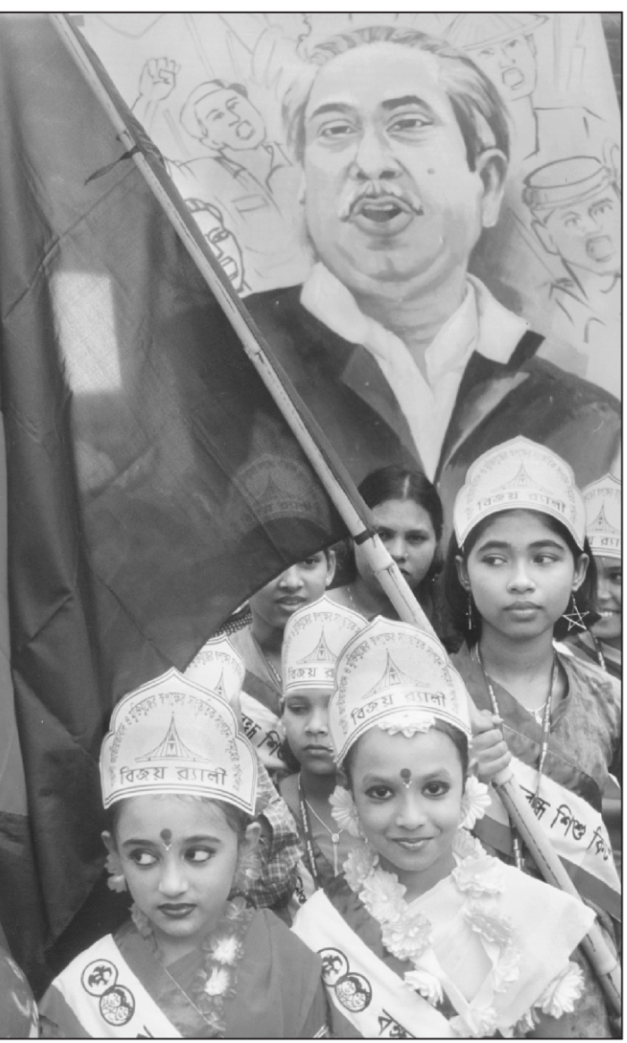
Different cultural organisations, including the Bangabandhu Shishu Kishore Parishad, jointly took out a victory procession in the city yesterday to mark the Victory Day.

The prime minister in her message said, "It's my firm belief that the brotherly relations that so happily exist between the two countries will grow in depth and dimension to our mutual benefit in the coming years."