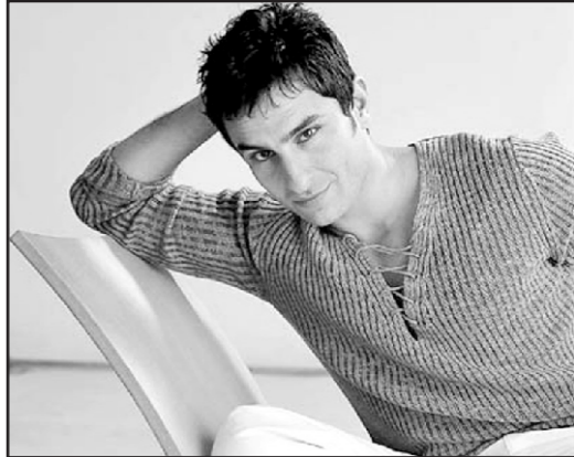
Saif Ali Khan

Saif Ali Khan plays a dark character in this revenge thriller due for an early release and has a very exciting role say insiders.