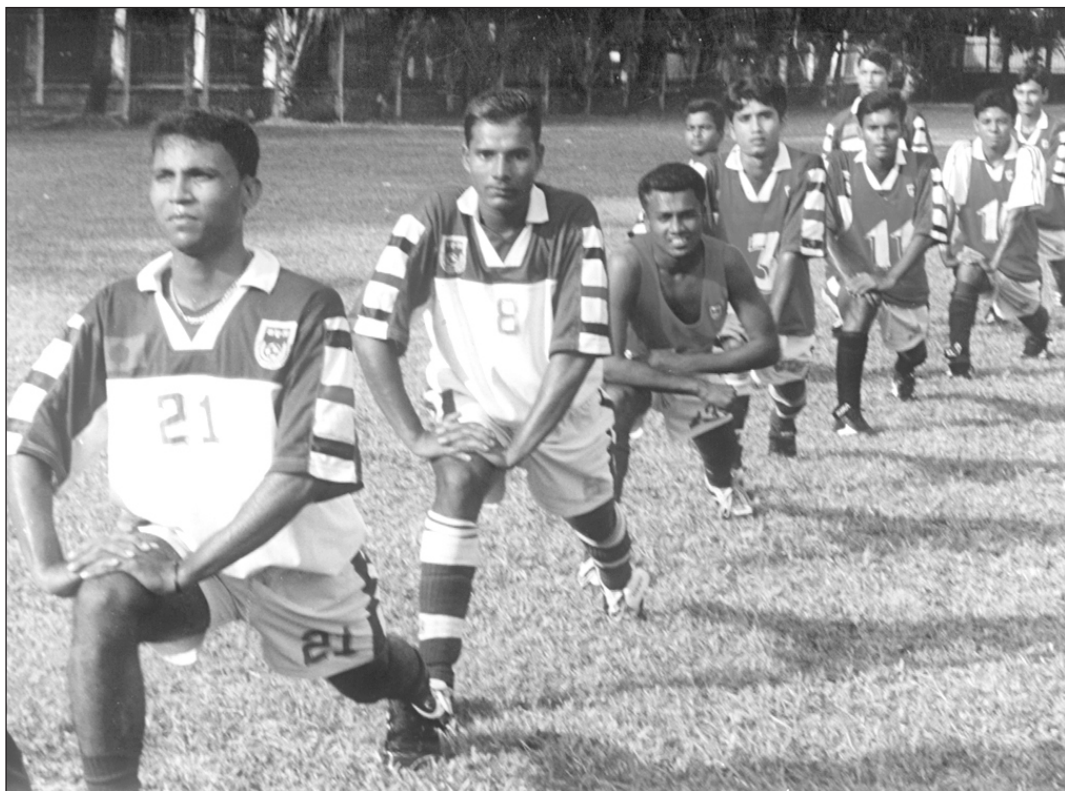
Bangladesh U-20 football team members warm up before their practice session at the BUET ground in the city yesterday.