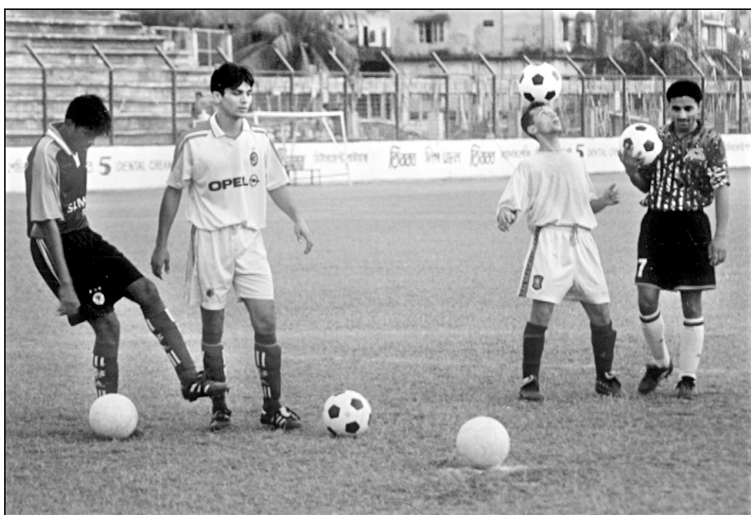
Pakistan under-20 booters practise at the Shaheed Bir Shreshtha Mustafa Kamal Stadium at Kamalapur yesterday.