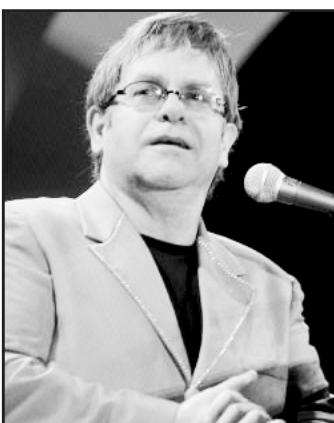
Sir Elton John

Former Spice Girl Mel C is to host a special 40th anniversary edition of Top of the Pops to be shown around the world. The New Year's Eve edition of the show will be shown on BBC prime and seen by audiences in Europe, the Middle East and Africa. Viewers will be able to choose their favourite performances from the last 40 years of the show.