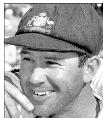
RICKY PONTING leader and I'm confident I can transfer these skills across to the Test arena," he said. Waugh, who announced on

years ago, said he was honoured to be given the job. "The one-day captaincy has given me a valuable insight into the characteristics required to be a successful