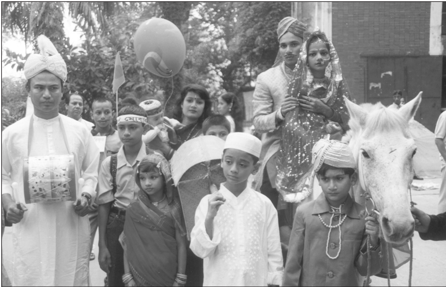
The Dhakabasi took out a colourful procession in the city on Thursday as part of its Eid celebrations.