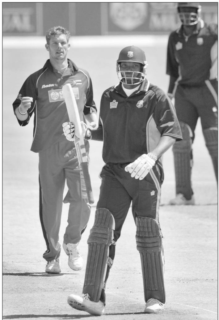
HERO YESTERDAY, VILLAIN TODAY: West Indies opener Chris Gayle walks back to the dressing room after being dismissed cheaply against Zimbabwe in the second one-day international in Bulawayo yesterday.