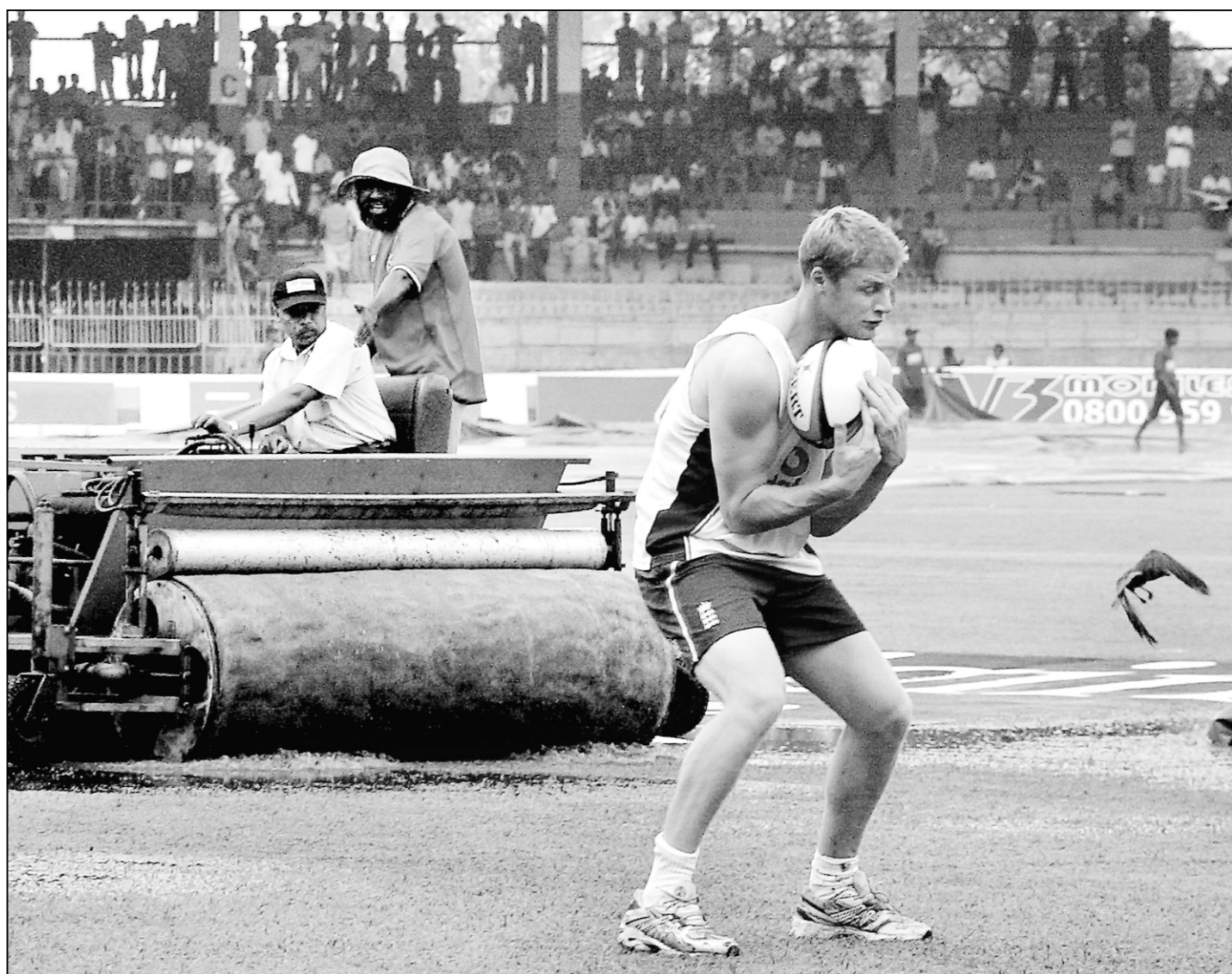
RUGBY PREVAILS: England all-rounder Andrew Flintoff plays rugby after the third and final one-day international against Sri Lanka was rained off in Colombo yesterday.