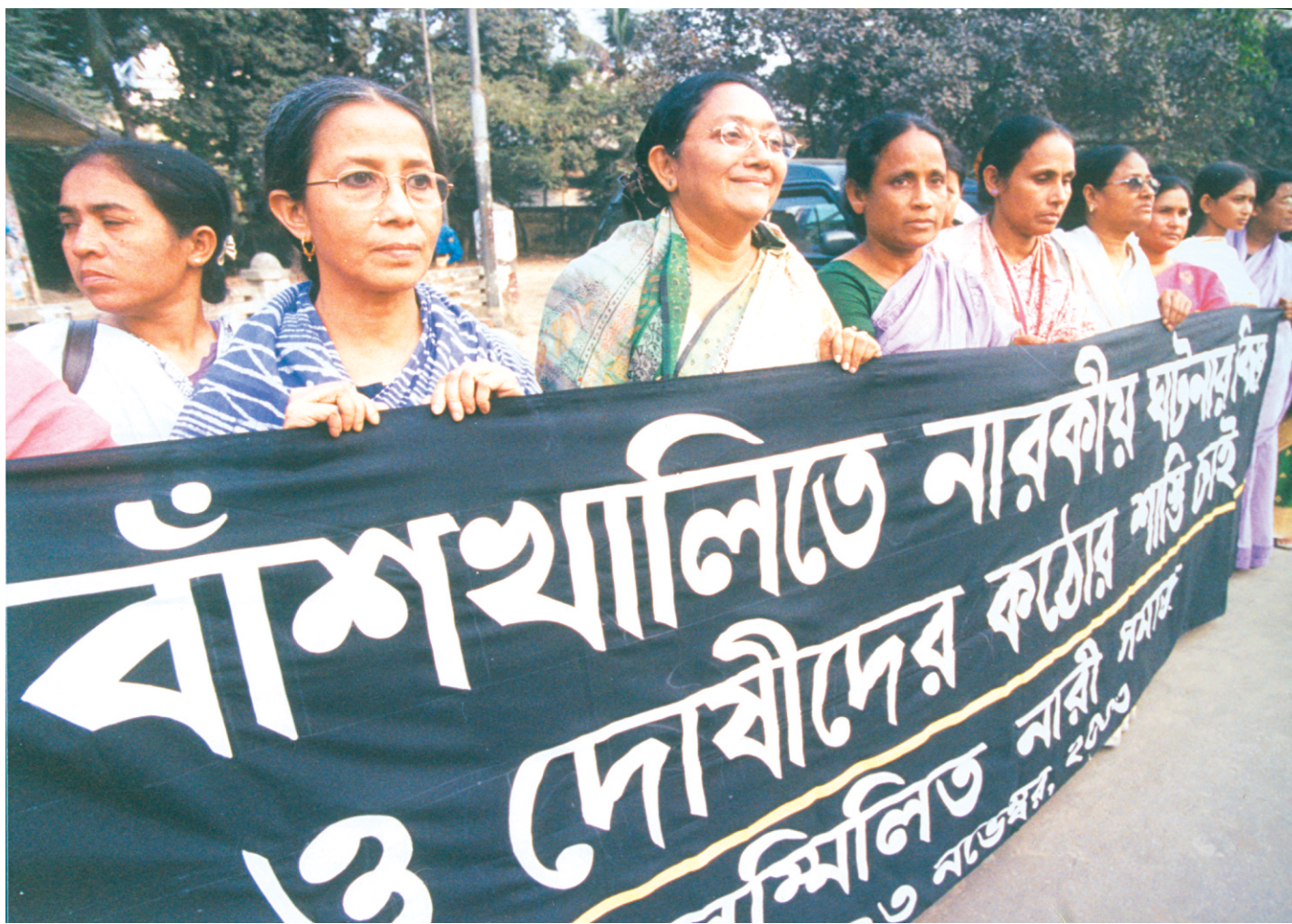
The Sammilita Nari Samaj formed a human chain at Muktangan yesterday protesting the arson attack in which 11 members of a family were killed at Banskhali, Chittagong.