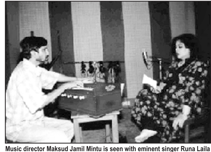
at a session for tuning music for the Humayun Ahmed film Chandrakotha.