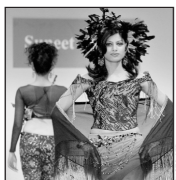
Sri Lankan models display outfits during a fashion weekend in Colombo recently.