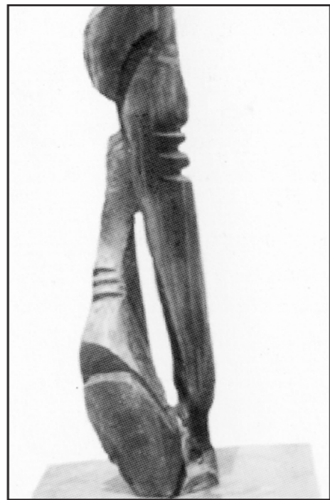
'Life-1' by Md. Abdur Rahim

times, all add to the delineation of mass confusion. "The images have been put there." Rahaman said, "to depict the fact that there is a lot of disruption in the life around us. Today we say one thing and tomorrow we contradict it. The intertwining ropes, shown in different shapes and sizes, also stand for the prevailing chaos. While everything appear to be frozen in time, the ants, however carry on creeping on the ropes. Other elements too are shown in action, such as the hammering hands of the monkey and the swinging trunk of the elephant. There is the comic relief in the narration of the story of our lives. Some of the elements are simply there