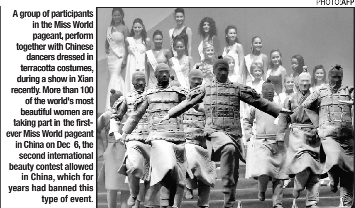
A group of participants in the Miss World pageant, perform together with Chinese dancers dressed in terracotta costumes, during a show in Xian recently. More than 100 of the world's most beautiful women are taking part in the first-ever Miss World pageant in China on Dec 6, the second international beauty contest allowed in China, which for years had banned this type of event.