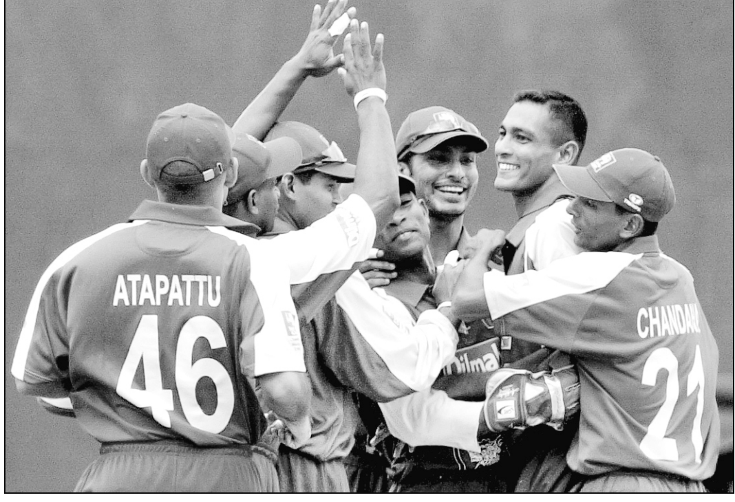
THE JOY THAT LASTED LONG: Sri Lanka cricketers celebrate the fall of an England wicket in Dambulla yesterday.

balls containing seven hits to the fence. Sri Lanka captain Marvan Atapattu was delighted at the quick finish in the first day-night match at the Rangiri International Stadium. "I can't ask for anything more," he said. "Everyone knows how explosive our openers are and they showed it here on Tuesday." England, who swept both the Test and one-day series in Bangladesh, caved in against Sri Lanka's new pace duo of Dinusha Fernando and Nuwan Kulasekara, although veteran Chaminda Vaas was the chief destroyer with three for 15. Fernando began the rout by taking a return catch to dismiss debutant opener Andrew Strauss and then bowled Vaughan with one. Vaas removed left-handed opener Marcus Trescothick and stopped all-rounder Andrew THE SORRY SCOREBOARD ENGLAND M. VAUGHAN 02 J. ANDERSON 04 M. TRCSCOTTHICK 09 I. BLACKWELL 03 R. CLARKE 02 P. COLLINGWOOD 31 A. FLINTOFF 03 A. GILES 21 R. JOHNSON 06 C. READ 00 A. STRAUSS 03 SEE PAGE 14 COL 2