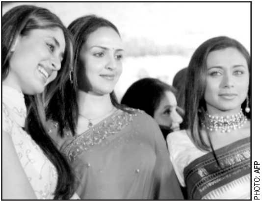
Kareena Kapoor (L), Esha Deol (C) and Raneek Mukherjee (R) smile during the release of the soundtrack of the movie "Line Of Control" in Bombay. The 1999 Kargil conflict between India and Pakistan which claimed 1,000 lives, is a big-budget movie starring some of the most famous names in Bollywood.

manage time for the shifting. Prima gets annoyed and Ashique tells her to take Shishir's help. Handsome and smart Shishir works at Ashique's office. Prima and Shishir look for a new house together. Gradually Shishir falls for Prima. His sister Shaali comes to know about it and says in amazement, 'How is it possible? She is a happily married woman...'