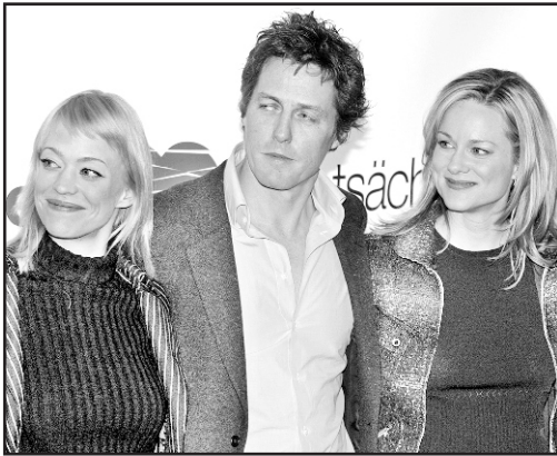
British actor Hugh Grant poses with German actress Heike Makatsch (L) and Laura Linney (R) in Munich during the German Premiere of the movie "Love Actually" by British director Richard Curtis. The comedy will be seen on German screens from 20 November.