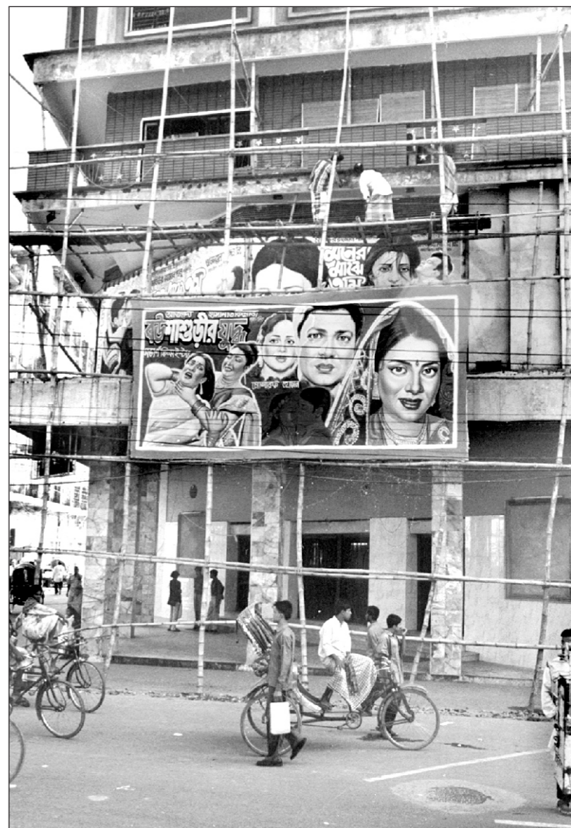
Modhumita Cinema undergoes renovation taking advantage of Ramadan