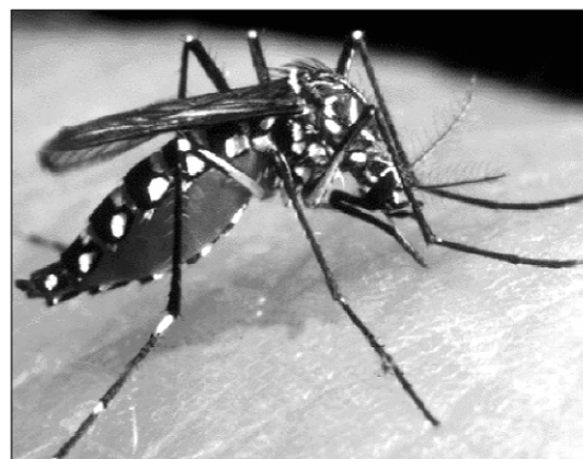
An Aedes mosquito

Dengue and dengue haemorrhagic fever (DHF) are caused by one of four closely related, but genetically dis-