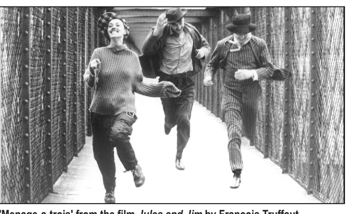
'Menage-a-trois' from the film Jules and Jim by Francois Truffaut

France and Germany presented us with some of the very best films in the history of cinema. The French Avant-Garde film movement of the 1920s, the French Poetic Realism of the 1930s and '40s, the French 'New Wave' of the late 1950s and early '60s, the German Expressionist film movement of the