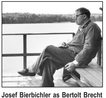
in The Farewell by Jan Schutte

France and Germany are considered to be the pioneers of the film art. The brothers Louis and Auguste Lumiere organised the first commercial screening of films at the Grand Café on the Boulevard des Capucines in Paris on 28th December 1895. La Sortie de l'Usine Lumiere a Lyon (The Workers Coming out of the Lumiere Factory) is the first of a series of minute-long films presented in that programme. But, before that they gave