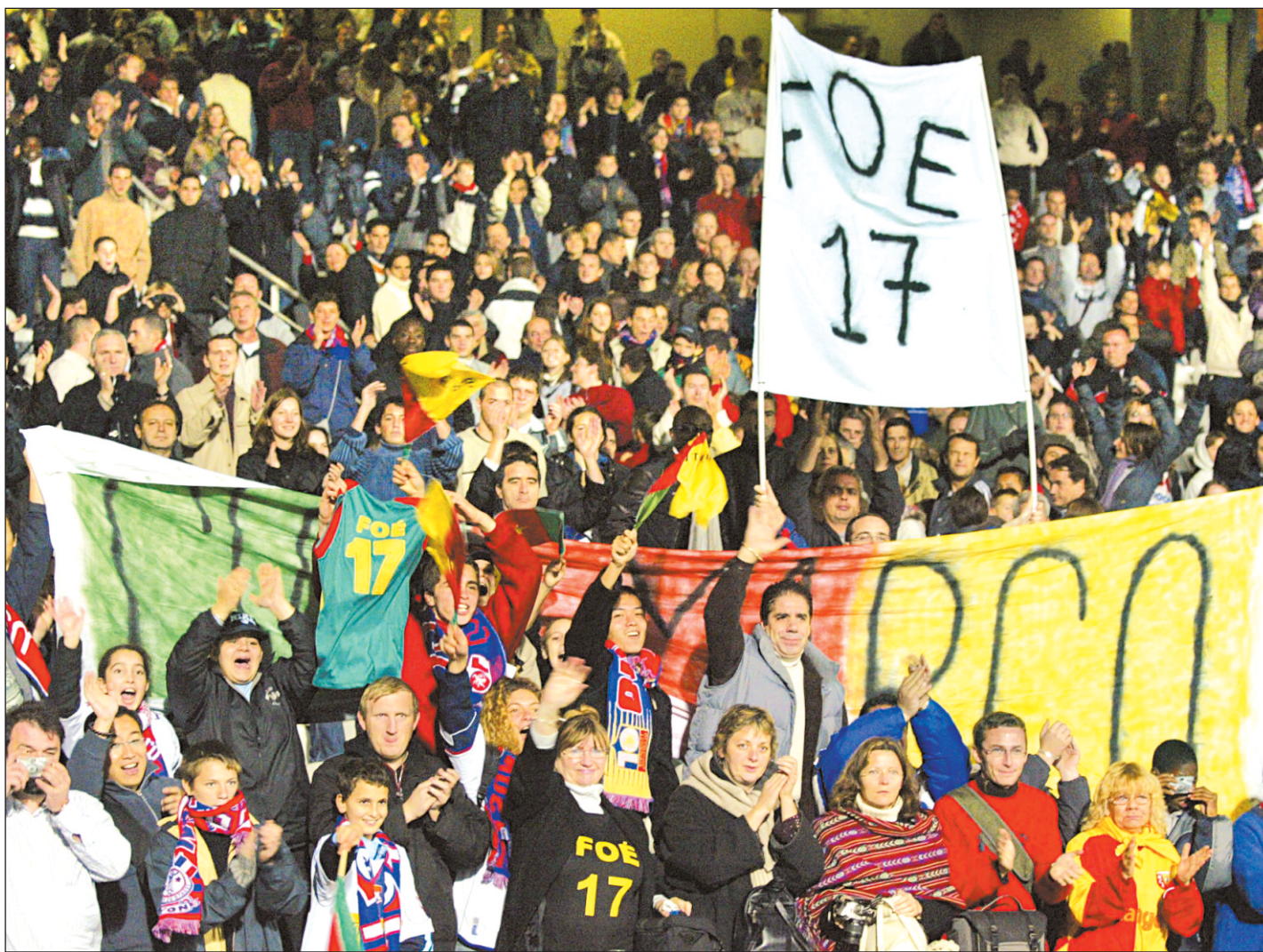
WE WILL NEVER FORGET YOU: (L) Fans recall Marc-Vivien Foe during memorial match to honour the Cameroon footballer. (R) Sony Anderson talks to the son of the late player before the kick-off at Gerland Stadium in Lyon on November 11.