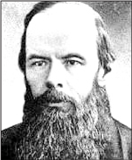
Fyodor Mikhailovich Dostoyevsky (1821-1881)