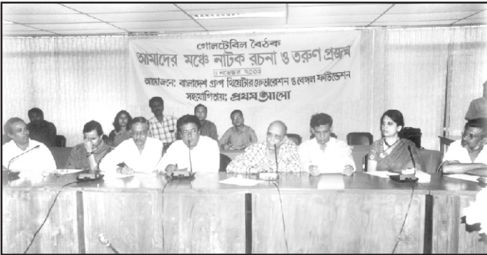
Renowned dramatists at the concluding ceremony of the playwrights' workshop.