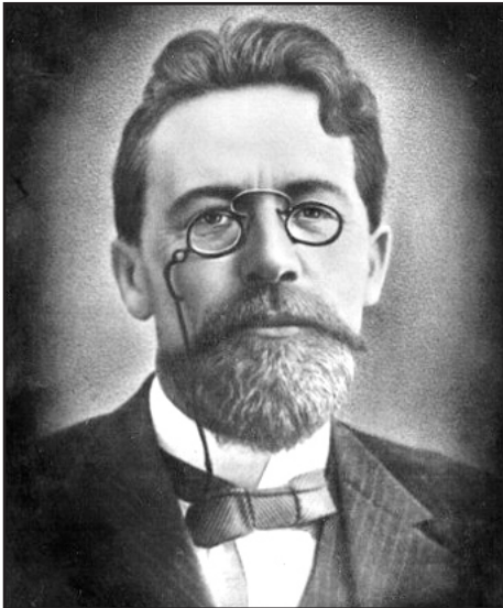
Anton Pavlovich Chekhov (1860-1904)

Zahir Raihan Film Society and Russian Cultural Centre present films adapted from classic Russian literature