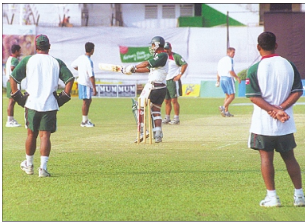
WHAT'S NEW? Bangladesh batsmen yesterday spent all their time practising pull-shots at the Bangabandhu National Stadium.