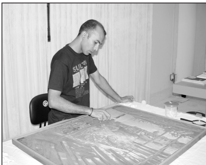
A student of the preservation of art workshop held at Dhaka recently; he is seen with his subject and equipment.