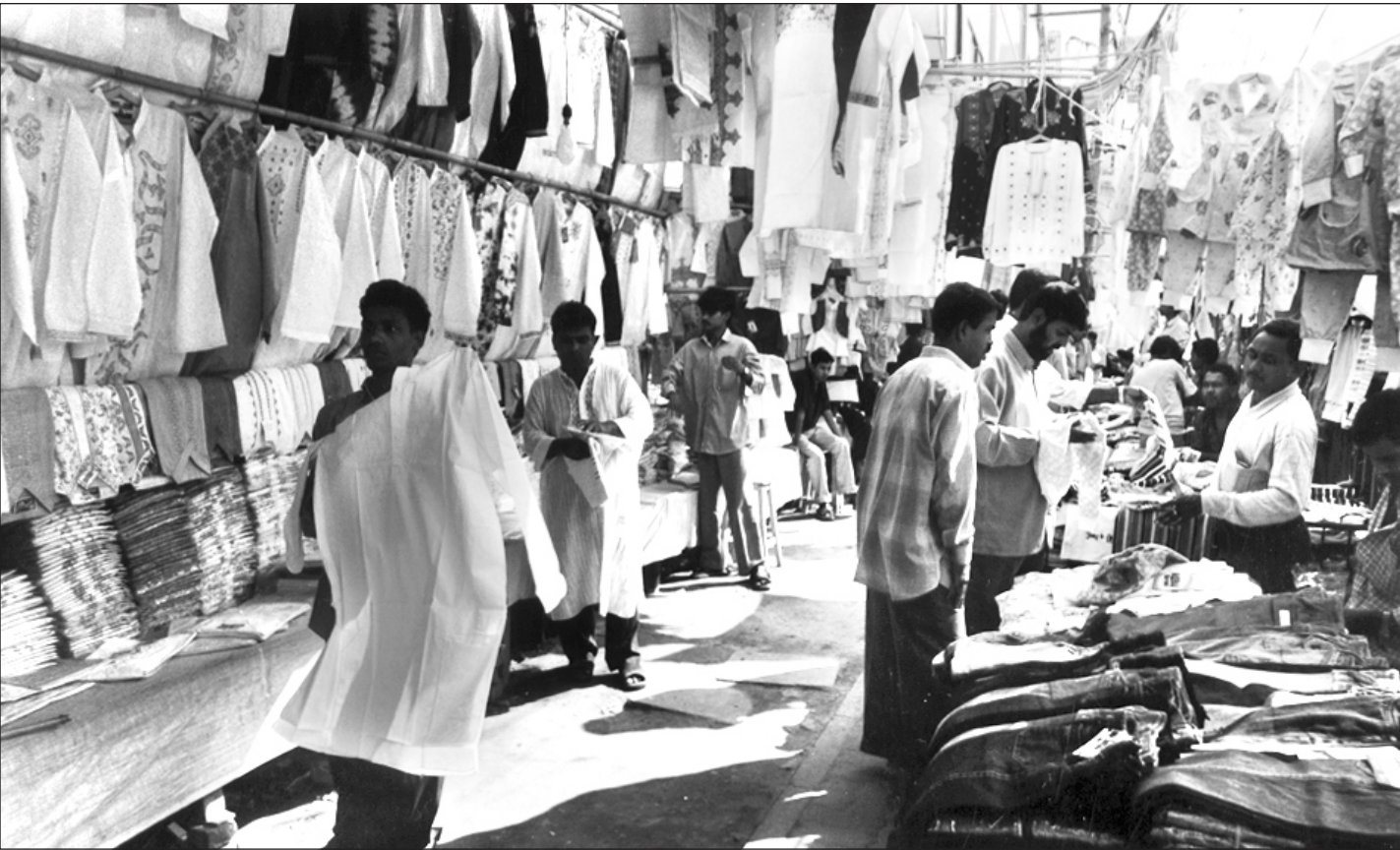
Hawkers have set up shops in front of the General Post Office building.