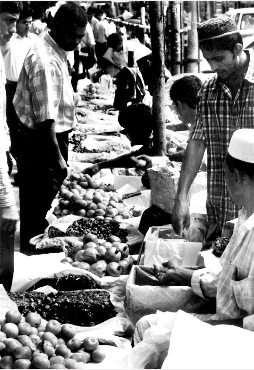
Fruit sellers near Motijheel are selling their items openly on the footpath.