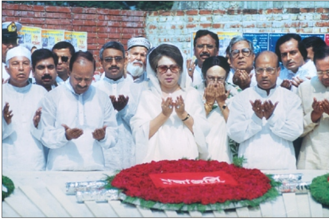
Prime Minister Khaleda Zia along with her cabinet colleagues offers prayers at the mazar of late president Ziaur Rahman after placing a wreath on the National Revolution and Solidarity Day yesterday.

UNB, Dhaka The National Revolution and Solidarity Day was celebrated across the country yesterday with a fresh vow to promote national progress. On this day in 1975, soldiers and people unitedly foiled a conspiracy against national independence and sovereignty and freed the then chief of army staff Ziaur Rahman from captivity in Dhaka cantonment. The day was a public holiday. President Iajuddin Ahmed and Prime Minister Khaleda Zia greeted the countrymen on the occasion. The president in his message said people and the valiant armed forces unitedly protected the country's independence and sovereignty through a revolution on this day in 1975. It is the sacred duty of every citizen to defend the country's SEE PAGE 11 COL 5