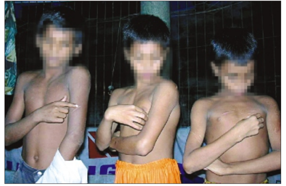
Children at a correctional centre show scars of self-inflicted cuts in a symbol of freedom in their drug subculture.

OUR CORRESPONDENT, Kushtia Two persons were killed and 25 others injured in a clash between two rival groups over capture of a waterbody at village Dhalsa in Mirpur upazila of the district yesterday. According to police, two rival groups-- one led by Zoarder and the other by Sarder -- of the village had a long rivalry over control of Aujangachhi beel (waterbody). Naharul, 30, of Sarder group was stabbed to death by the men belonging to Zoarder group when he went to the waterbody for fishing yesterday morning. Hearing the news, villagers loyal to Sarder group rushed to the spot and locked in a clash, leaving one Zinnah, 35, of Zoarder group dead and 25 others of both groups injured. Police went to the spot and brought the situation under control. The injured people were admitted to Mirpur Health Complex. Two separate cases were filed with Mirpur Police Station. No one was arrested till yesterday afternoon.