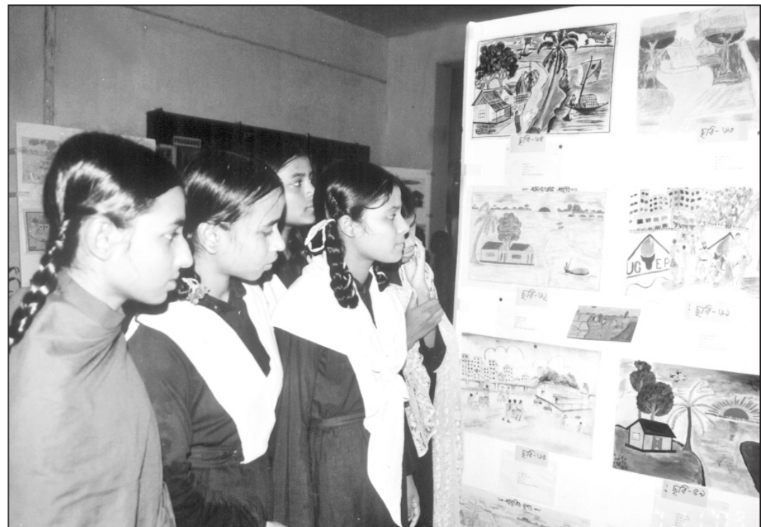
A painting exhibition, organised by the Underprivileged Children's Educational programmes (UCEP), was inaugurated on its premises in the city yesterday. The exhibition will remain open till Thursday next from 10.00am to 4.00pm daily.

A discussion and an iftar party will be held at Ichhapur lodge in Tangail town today.