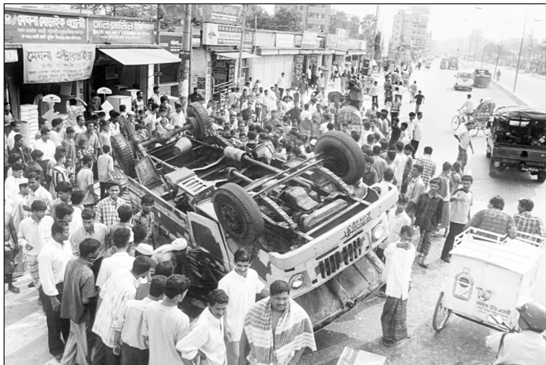
Locals and passers-by crowd around a pick-up van that turned turtle after crashing into a road divider at Kuril in the city yesterday. However, there was no report of casualties.