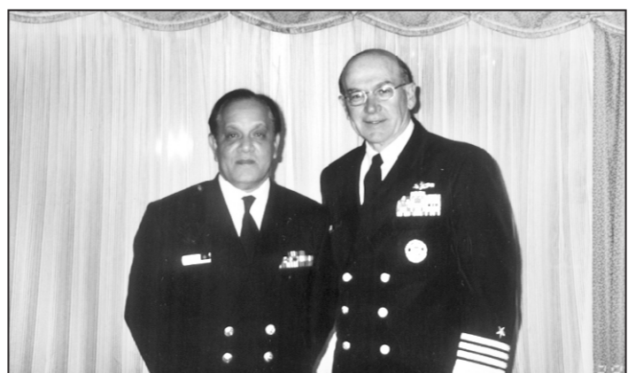
Chief of Naval Staff Rear Admiral Shah Iqbal Mujtaba poses with Chief of Naval Operations of the US Navy Admiral Vern Clark during the 16th International Sea Power Symposium held at the US Naval War College in Washington recently. The navy chief returned home on Sunday ending his four-day official visit to the USA.