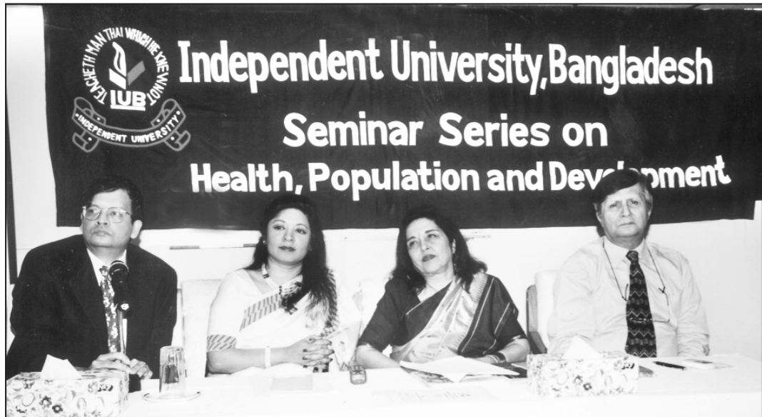
Participants at a seminar on Population Issues held in the city yesterday. Independent University, Bangladesh organised the seminar.