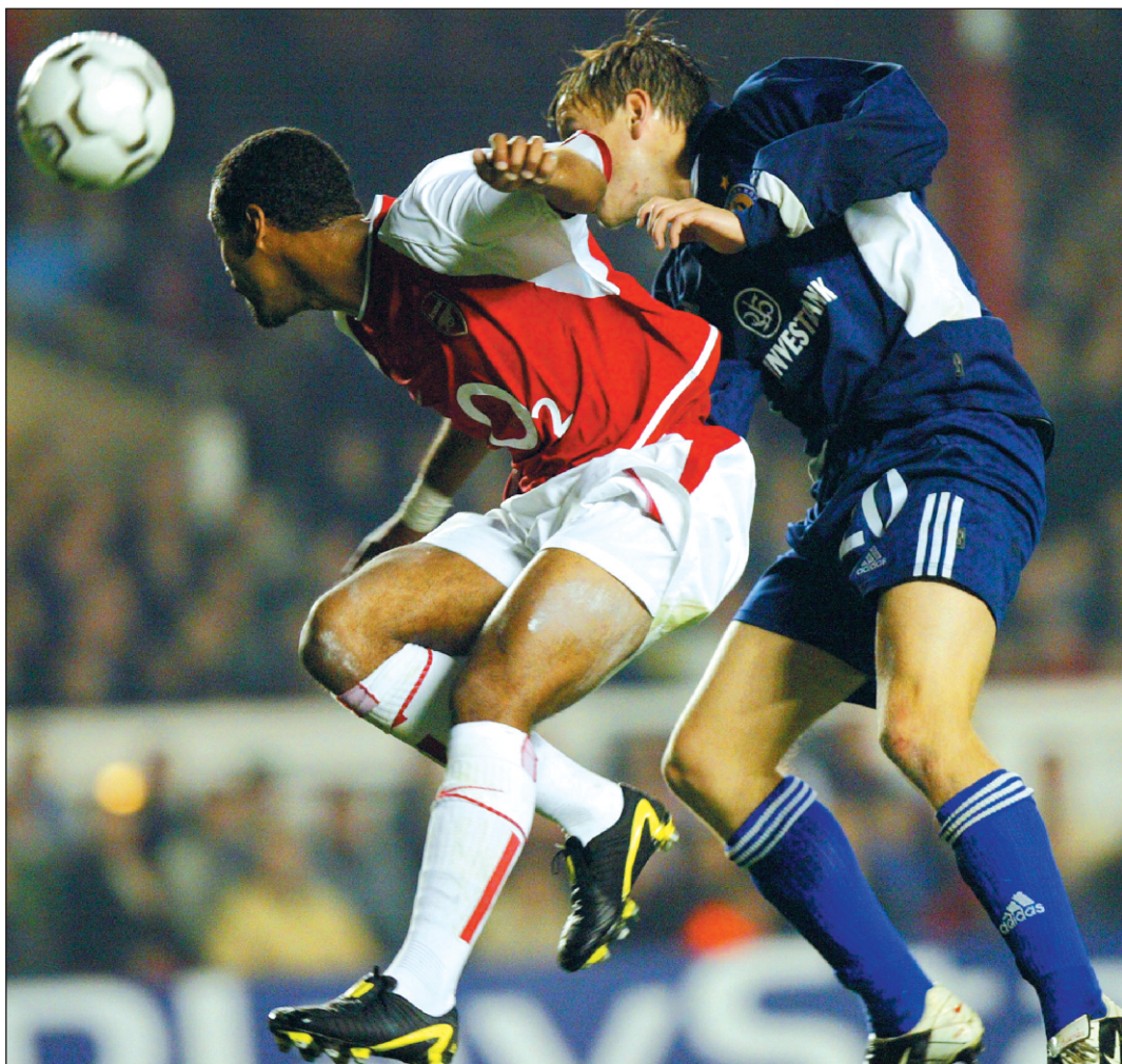
Ashley Cole (L) of Arsenal heads the ball away from Dynamo Kyiv's Oleh Husev at Highbury on November 5