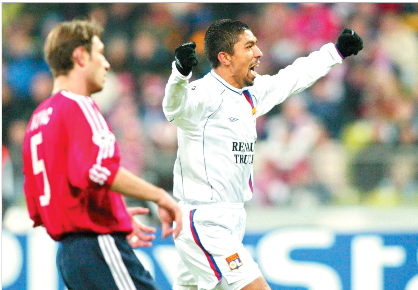
THE GHOST OF ELBER! Olympique Lyon's Brazilian striker Giovane Elber (R) is ecstatic after scoring the winner against his former club Bayern Munich at Munich on November 5.