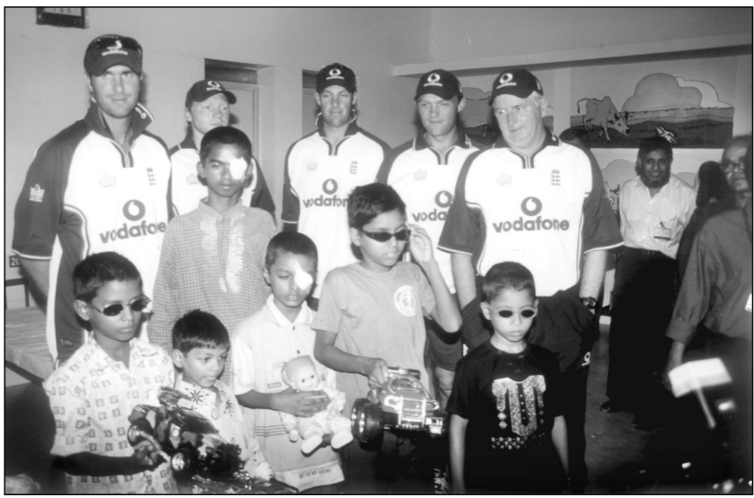
PHOTO: COURTESY WE ARE WITH YOU: Some of the England cricket team members and coach Duncan Fletcher visited the Islamia Eye Hospital in the city on Monday.

REUTERS, Colombo Sri Lanka's selectors have picked a new-look pace bowling attack for a three-match one-day international series against England later this month.