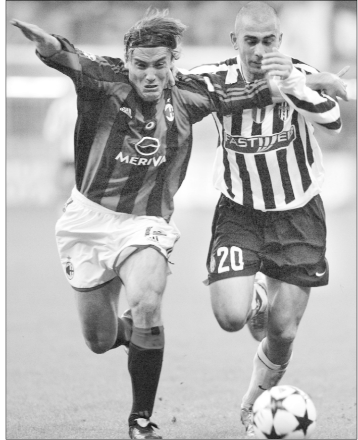
Juventus striker Marco Di Vaio (R) fights for possession against Milan's Carotian defender Dario Simic at the San Siro stadium on Saturday.

Van Nistelrooy continued: "During the qualifiers I have played five matches and in those games I have been substituted four times after 60 to 70 minutes."