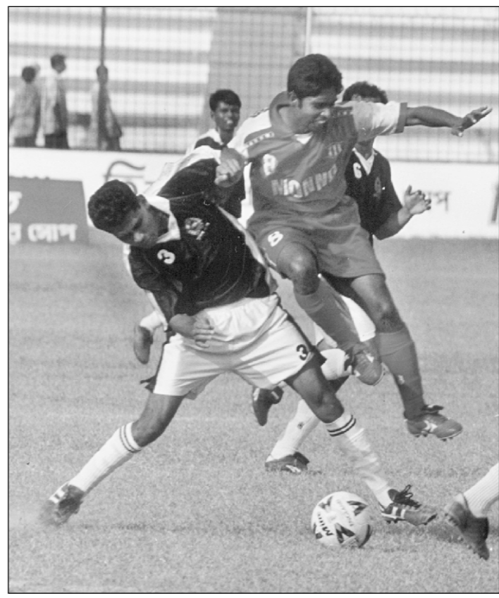
Action from yesterday's Tibet Federation Cup football encounter between Wari Club and Bangladesh Police at the Bir Shreshtha Shaheed Mustafa Kamal Stadium in Kamalapur.

"It's up to the selectors. But I would like to carry on."