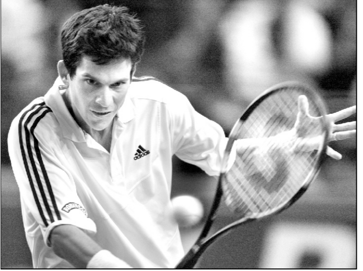
Briton Tim Henman plays backhand against Roger Federer of Switzerland at the Paris Masters Series tournament on Friday.

The second set followed a similar pattern although Bjorkman was a net