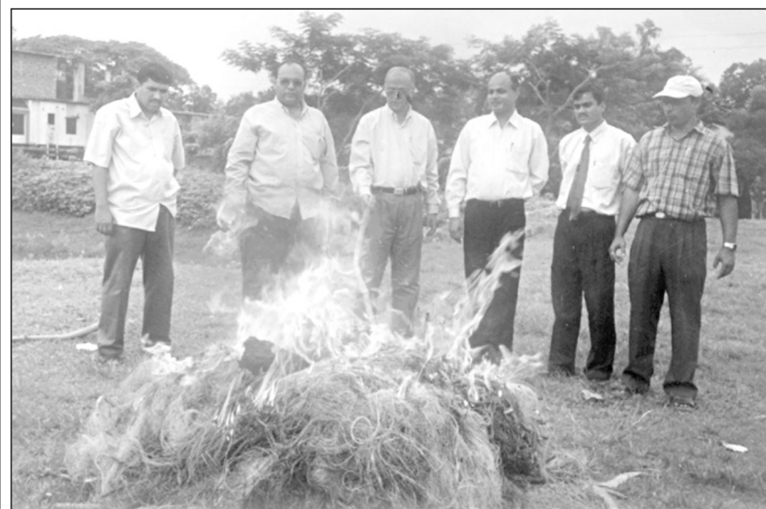
Current nets seized by Fisheries Department in different areas of Manikganj in last few days are being burnt. Use of current net for fishing is banned. The photo was taken on Thursday.

Later, the death certificate was obtained from one of the hospital directors. The ambulance was also returned at around 2:30pm after hospital authorities apologised and fired the negligent doctor.