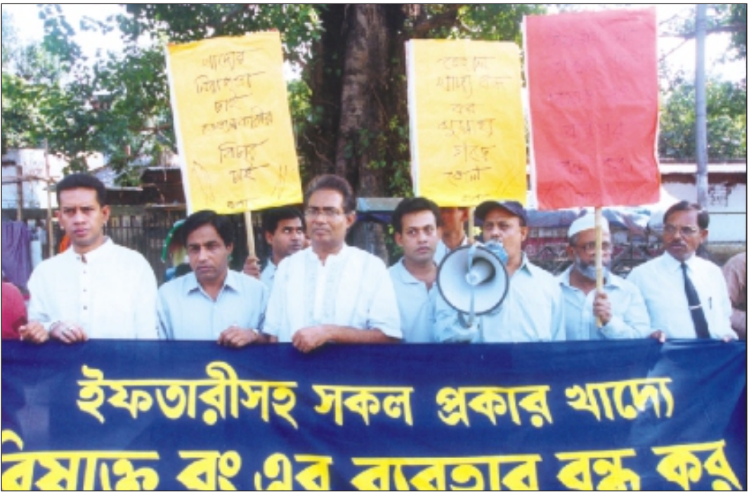
Bangladesh Paribesh Andolon holds a rally at Shahbabbh in Dhaka yesterday demanding an end to widespread use of harmful colours and preservatives in food items, including iftar delicacies.