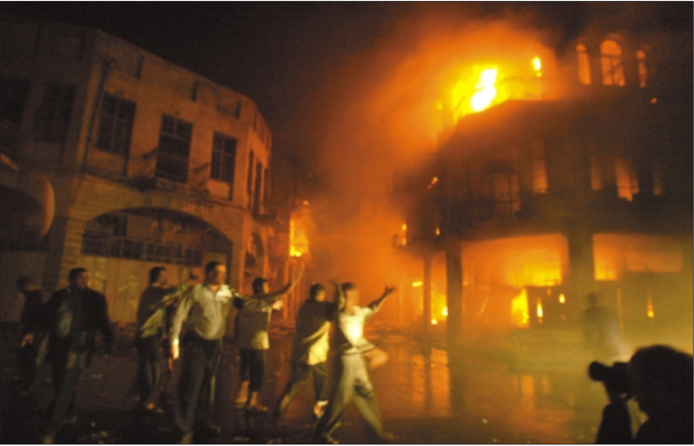
Iraqi firemen extinguish a fire, started apparently by a loud blast, in two central Baghdad buildings that claimed the life of a man and wounded eight others on Thursday.