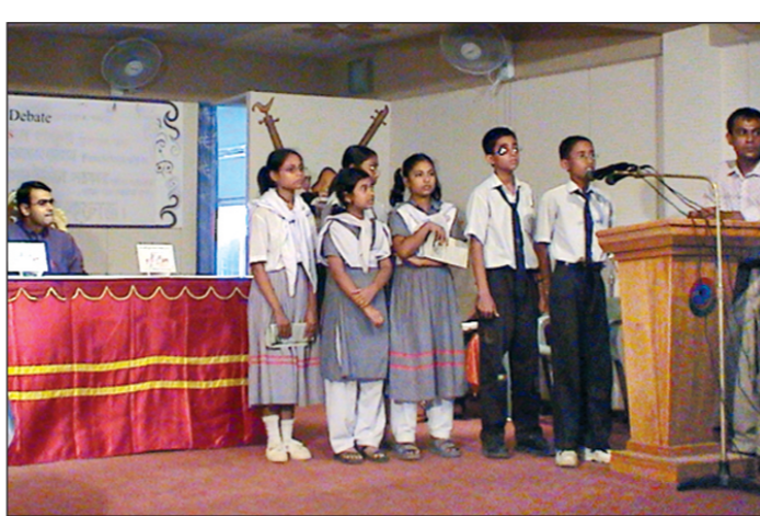
Students take part in a daylong inter-school debate on 'Child rights' at Tongi recently. The Hongkong and Shanghai Banking Corporation (HSBC) Limited sponsored the event organised by the Working for Better Life, an NGO.