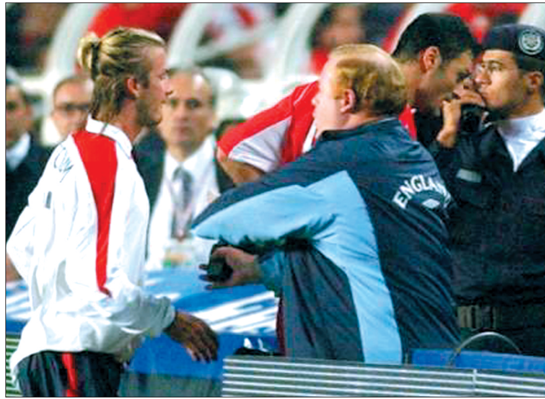
A file photo of England captain David Beckham (L) being held back security officials as he follows Alpay Ozalan into the tunnel at half time during their Euro 2004 qualifying match against Turkey.