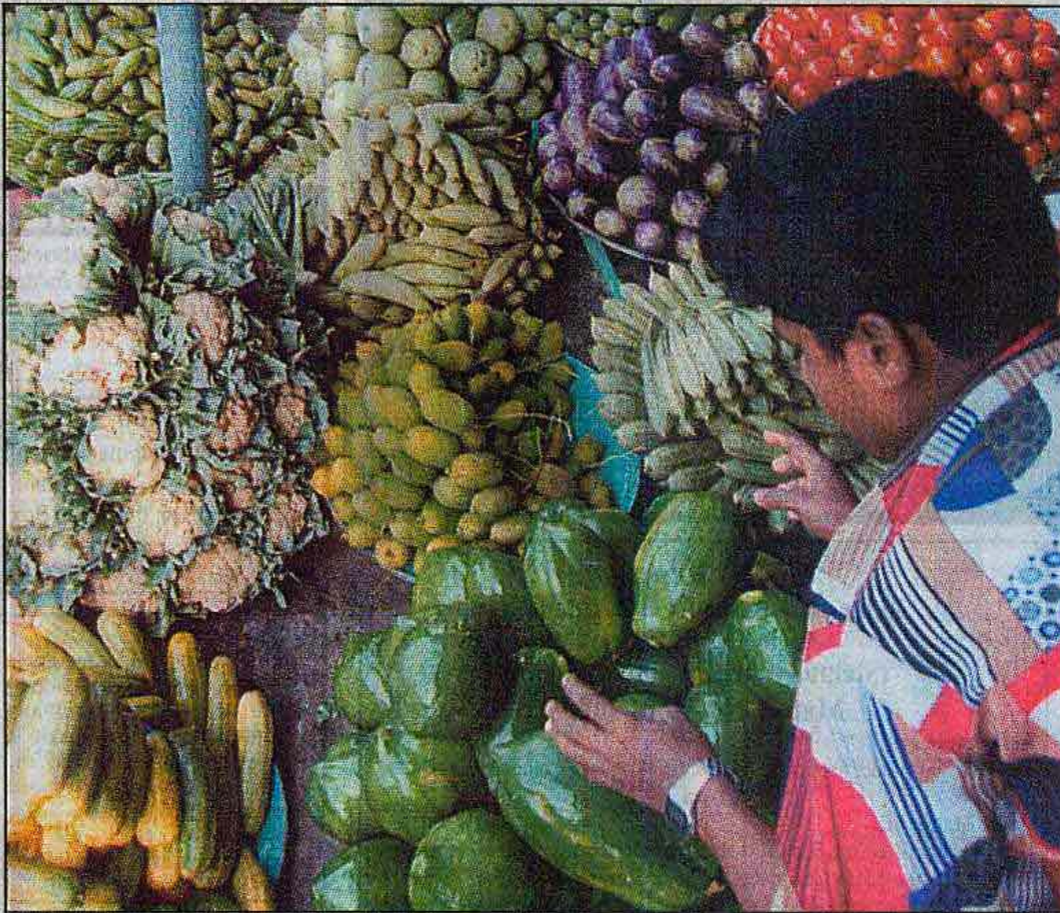
Vegetable vendors at Motijheel Colony Market have stocked up for Ramadan although high prices still restrict the low-income group to a fraction of their normal purchases.