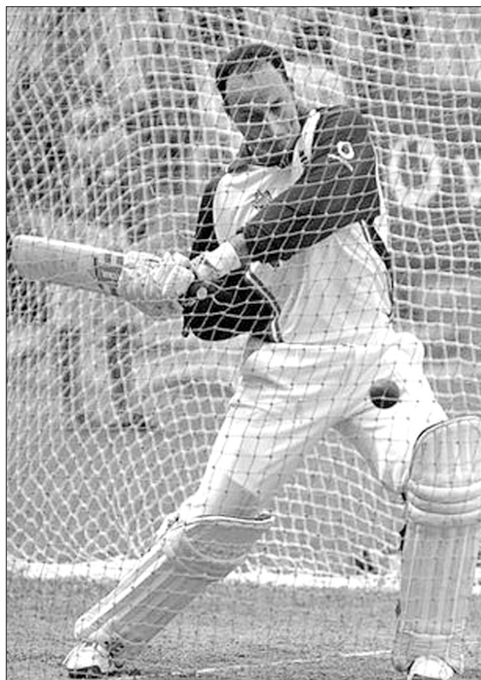
England's Nasser Hussain bats in the nets at the BNS yesterday.