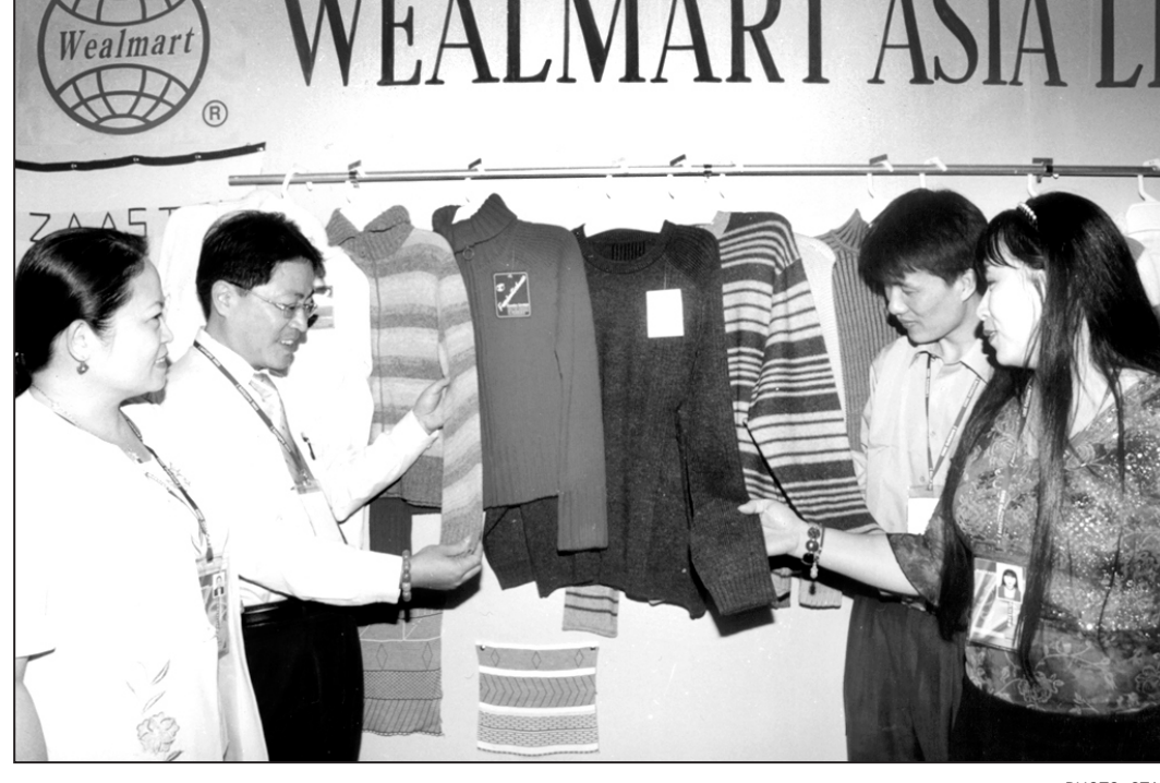
A group of foreigners at a stall at the three-day Bangladesh Apparel and Textile Exposition -- Batexpo 2003 -at Sonargaon Hotel in Dhaka yesterday.

The Outlander is a sophisticated modern all-wheel-drive with innovative style and a distinctive sports utility vehicle (SUV) with powerful 2.4 litre SOHC engine, says a press